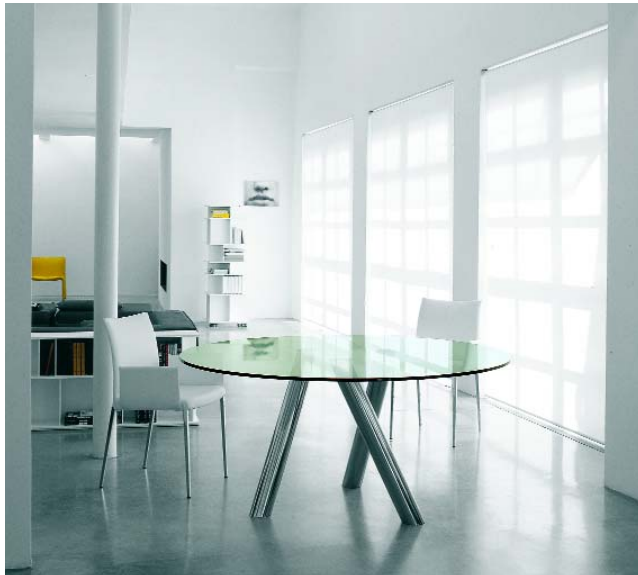
ABOVE: The Ray, a sleek dining table design from Cantoni, features a glass top with three chrome legs. About $2,729

from the earth," he says. "I don't think people realize metal and concrete are sustainable items. You can have a piece of furniture that was recycled from a car 100 years ago."