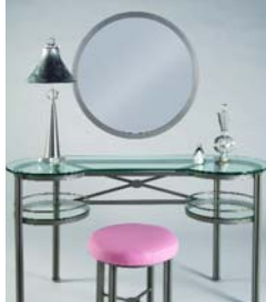
LEFT: Pamper yourself with The Tiffany Collection by John Le Shane for Johnston Casuals Furniture. The vanity, mirror and stool shown are in a Topaz powder coat with a Pink Chicago Leather seat. More details include a specially cut and shaped 1/2-inch glass top with two round insets. Suggested retail price is about $1,800. Cantoni is a local dealer.

That is where many people make a most unfortunate mistake. The latest productions in metal furniture suggest nothing of a cold, unforgiving form, designed only for those who appreciate its hard lines or industrial rawness. Today's metal offerings are stylishly clean, delightfully retro and fused with a cross-section of woods, fabrics, cushions and finishes that make them one of the most sought-after furniture trends available on the planet.