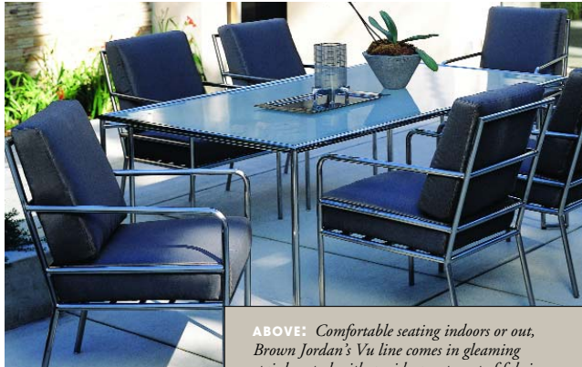
ABOVE: Comfortable seating indoors or out, Brown Jordan's Vu line comes in gleaming stainless steel with a wide assortment of fabric colors and textures for seat cushions. Find Brown Jordan products at the Decorative Center in Dallas.