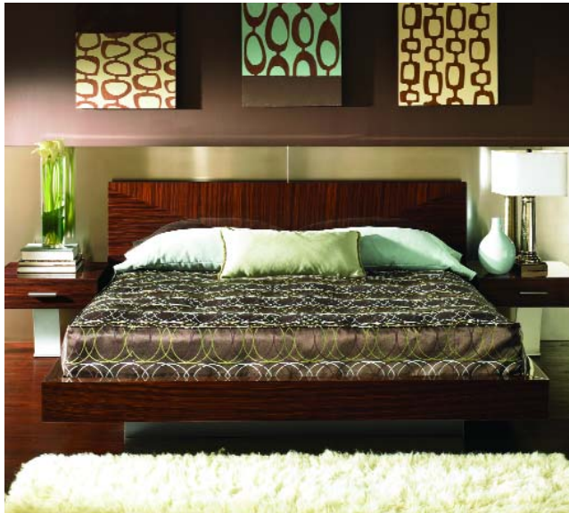
ABOVE: Cantoni's Madera bed is a modern, yet warm design that combines steel panels and wood veneer. About $7,979 in king size

with an antique armchair," she says. "We love the contrast of styles, finishes and materials."